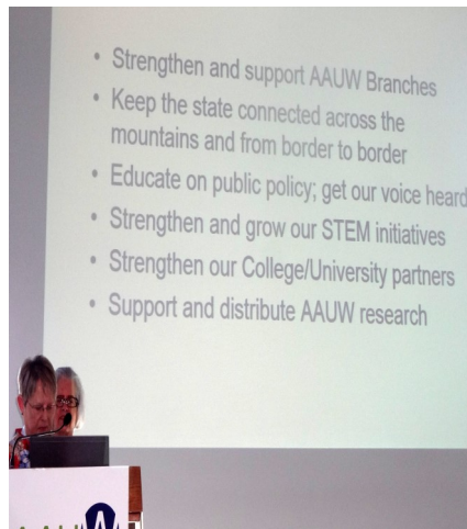
AAUW-WA Goals were presented and discussed