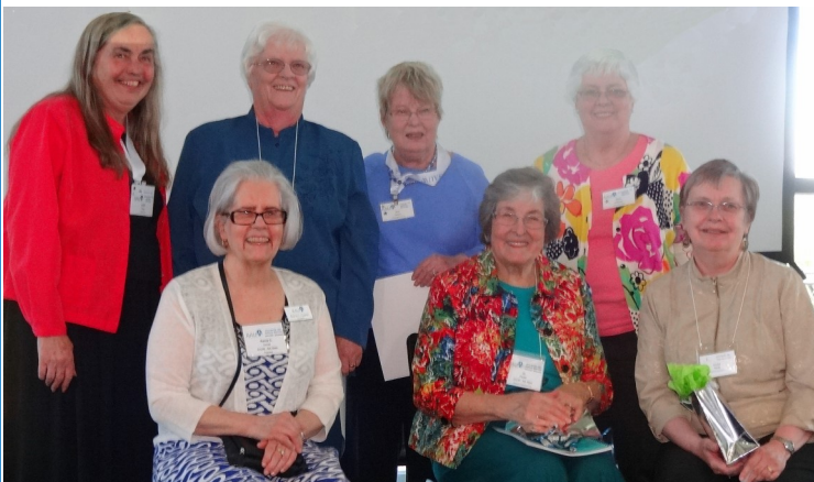
Past Washington State Presidents were Honored