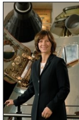
Right: Dr. Bonnie Dunbar