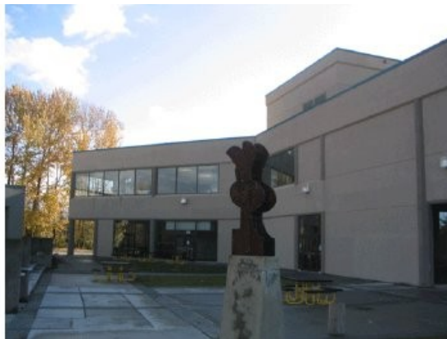
Walla Walla Community College

Some of you may want to come a day early as Sherman Alexie will be giving a free lecture on Thursday evening, April 15 th , at Cordiner Hall on the Whitman Campus. For more information, contact conventioncommittee@aauw-wa.org .